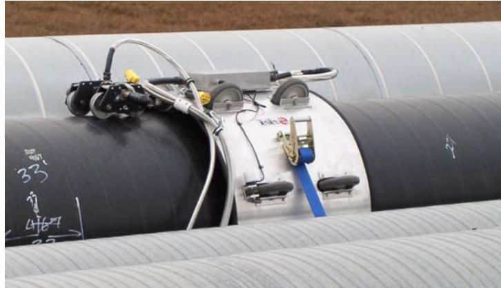
Figure 1: This photo shows the top half of the Line Cat rig and the magnetic-wheeled motor system.