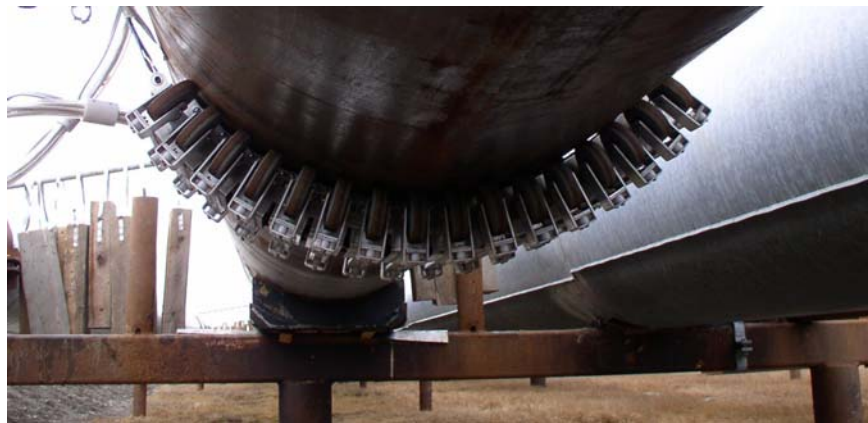
Figure 2: This is a picture of the underside of the Line Cat scanning rig. There are (16) 2" scanner pods that, when tightened against the pipe, provide a 32" wide scanning swath. Each scanning pod has a wheel at the front and rear in the same axial direction of movement, thus providing independent suspension for each 2" LFET scanner pod.